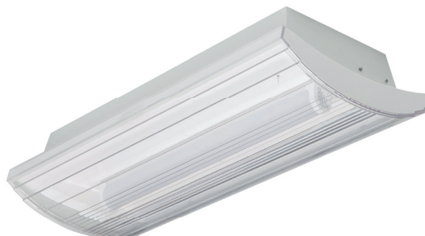
HBI Bisscheroux B.V. 3L06--F-- 300 Eagle / LVK (polair)